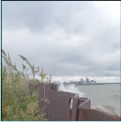
Dike 14, an 88-acre site adjacent to Cleveland's Gordon State Park, presents a unique opportunity for public access to Lake Erie

Dike 14 is a former disposal site that has become naturalized. This 88-acre wildlife haven provides unique access to Lake Erie. Because of its strategic coastal location and varied habitats, a remarkable diversity of birds, native Ohio plants and trees, and animals make their home on Cleveland's Dike 14 Nature Preserve.